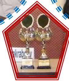
Quiz - Medal