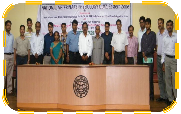
Team behind the seminar