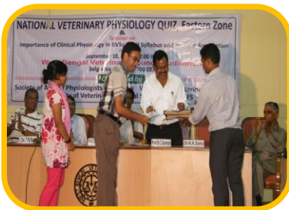
Appreciation certificate to AAU, Assam