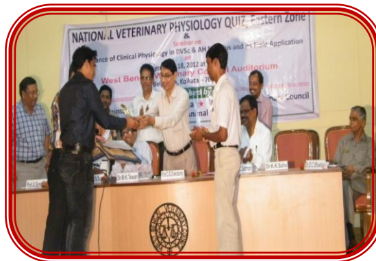
Winner team of BAU, Jharkhand