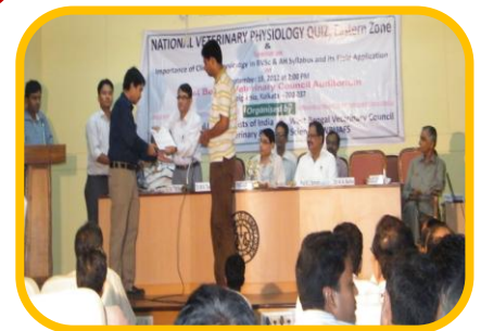
Appreciation certificate to WBUAFS, WB