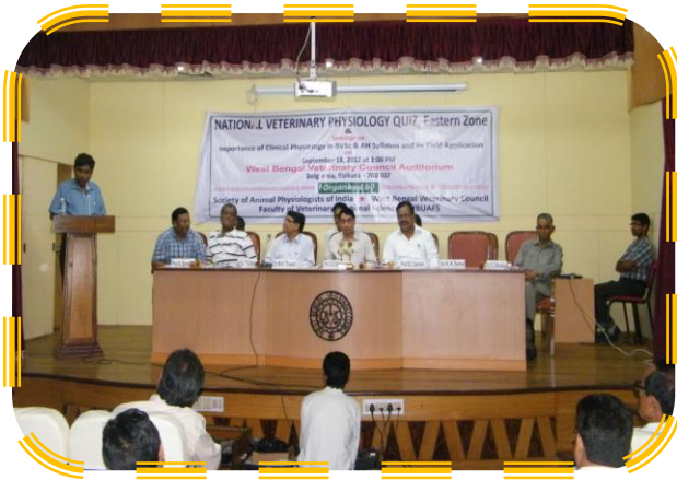
Dignitaries at dias