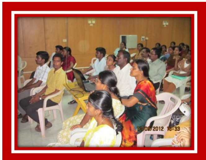
Students are participating in Quiz in Veterinary College, Namkal, TANUVAS