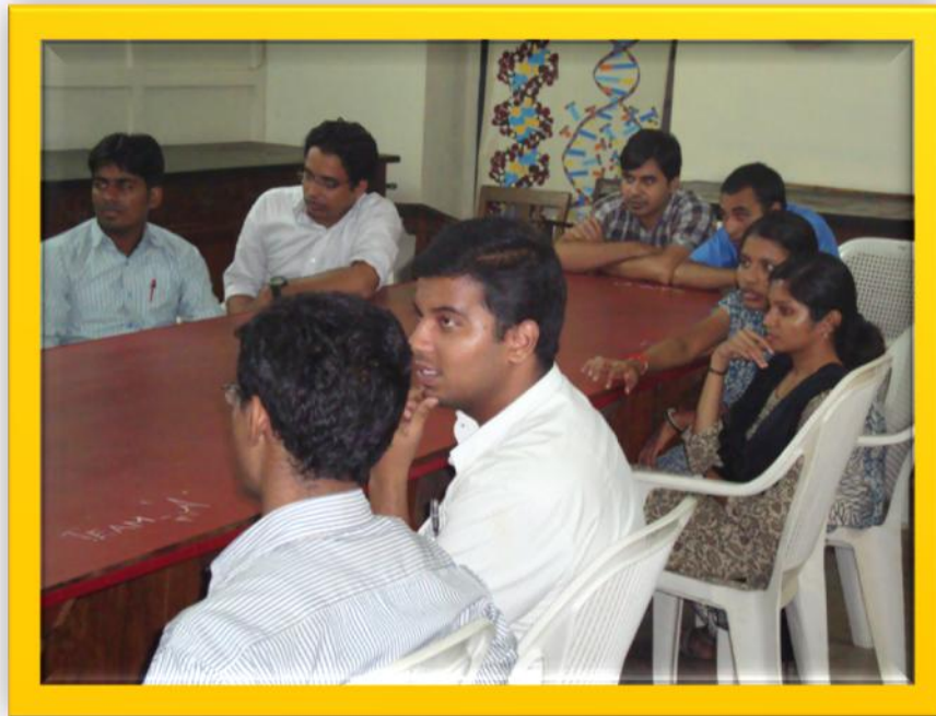
Students are participating in Quiz in Madras Veterinary College, TANUVAS